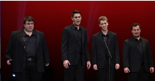
Pratt Street Power