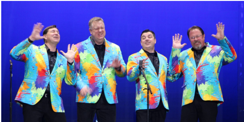
Hemidemisemiquaver4 (You gotta see these jackets in FULL COLOR online.... )